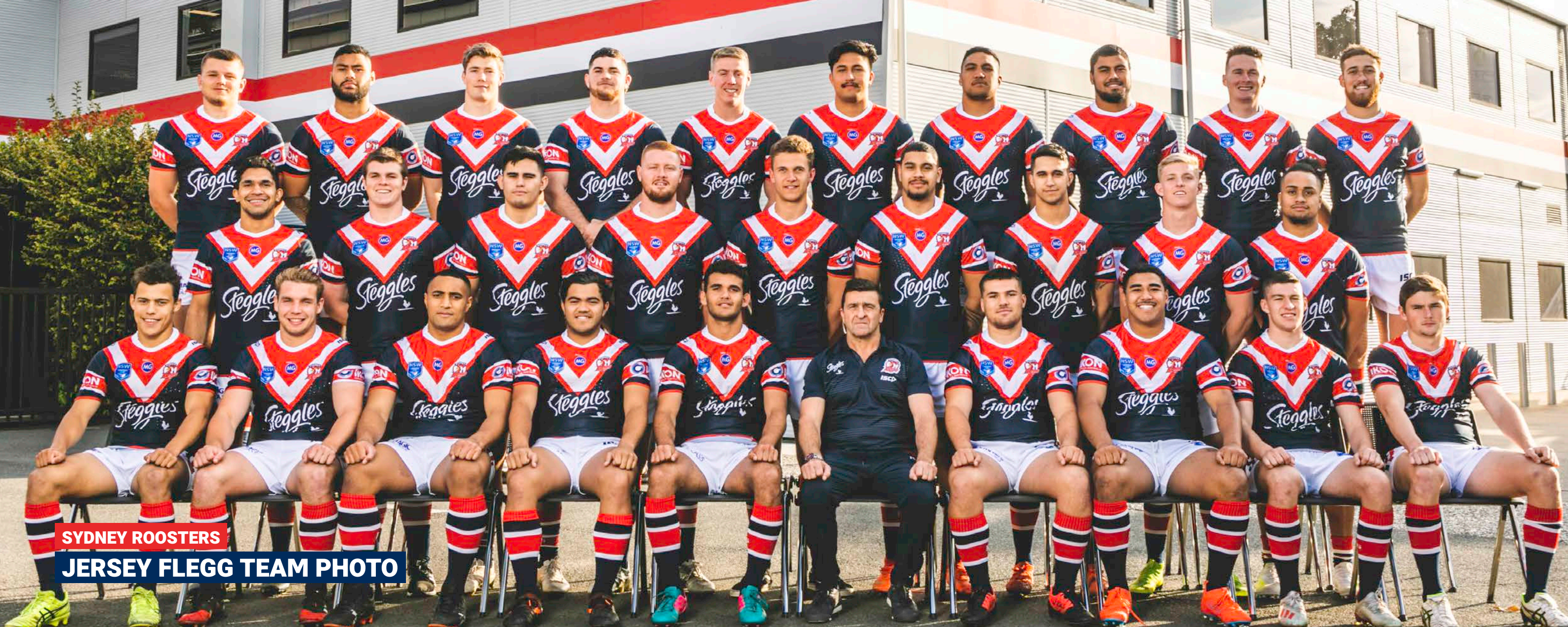
SYDNEY ROOSTERS JERSEY FLEGG TEAM PHOTO

The Tricolours program introduced in 2018, continued in 2019 to help development and secure players in our Junior Pathways system. This program is a new initiative and an integral part of the Sydney Roosters development pathway. The Academy is designed to continue the progress for our juniors as a rugby league player with a particular emphasis on fundamental skills of the game, position specific training and exposure to multiple team structures. This academy program will help identify more juniors and players coming through our system across the Eastern Suburbs, Central Coast and New Zealand regions.